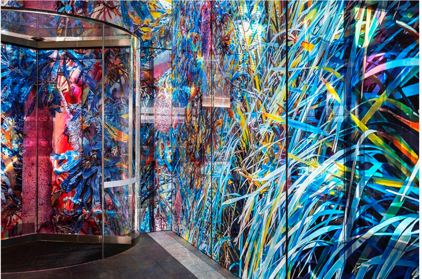
Printed film on glass, size: 1319 cm x 395 cm + 1339 cm x 520 cm ( side elements )