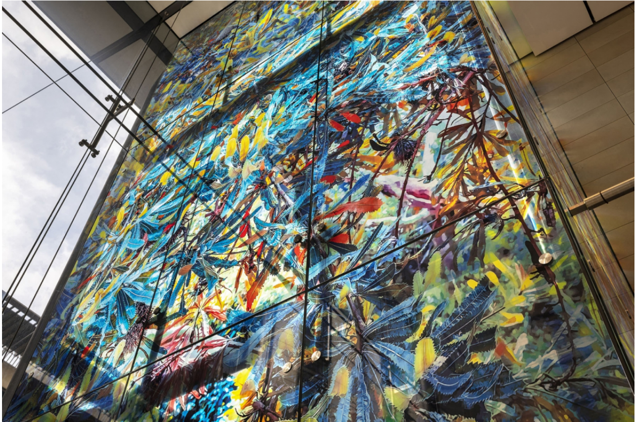
Printed film on glass, size: 1319 cm x 395 cm + 1339 cm x 520 cm ( side elements )

Shadows features images of plants native to New South Wales – including the strangler fig, Angophora, Banksia and the Gymea lily – referencing the history of Barangaroo and evoking how the land may have looked before European settlement.